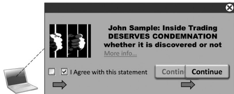
Figure 2 . Pop-up message during a computer process